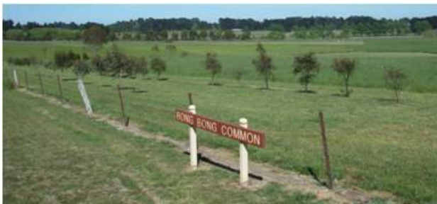
The proposed site for the Botanic Gardens on Bong Bong Common