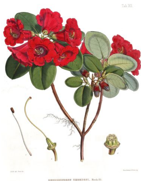
Rhododendron thomsonii , a species named after his friend from student days, who accompanied Hooker to Assam. A lithograph by W Fitch in Rhododendrons of Sikkim-Himalaya 1849-51

Having returned to Darjeeling, Hooker completed a map of Sikkim and organised for his botanic collection to be sent back to Kew. Before returning home he then spent nine months exploring Assam with an old friend from Glasgow University, Thomas Thomson, collecting amongst other things the blue orchid, Vanda coerulea . Hooker's time in Sikkim and Assam was a resounding success. Twenty-five new rhododendron species alone were identified (none of significance has been found since in Sikkim) and several of these such as R. griffithianum are parents to many of today's popular hybrids. Rhododendromania infected gardeners for the next twenty years. In addition, 150,000 herbarium specimens representing 7000 species were collected.