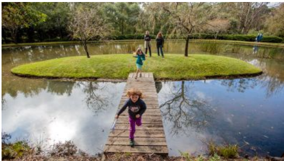
Children enjoying the bridge and lake at 'Greenwood', Kimberley Drive, Bowral