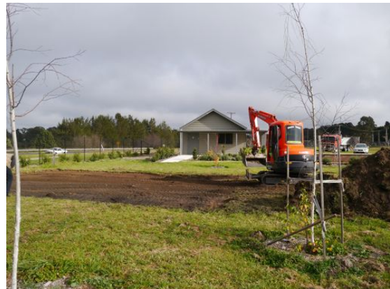
The diggers at work on the site

If you have driven past the site recently you will have seen some exciting activity. Construction of the new propagation and growing area has begun and hopefully will be finished in time for late winter propagating. It will make a change for the volunteers who have spent many hours using the back of Tony Davis's ute as the potting table.