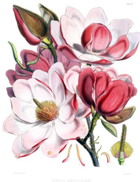
Magnolia campbellii named after the official taken captive in Sikkim. A lithograph by W Fitch from Illustrations of Himalayan Plants 1855

Next they explored further to the east and it was here that the real drama happened. Hooker had wished to explore tracks up two more passes and indeed it yielded a bounty with seed from 24 rhododendron species collected.