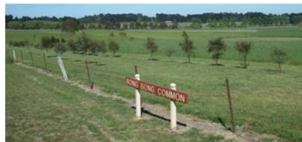
The proposed site for the Botanic Gardens on Bong Bong Common