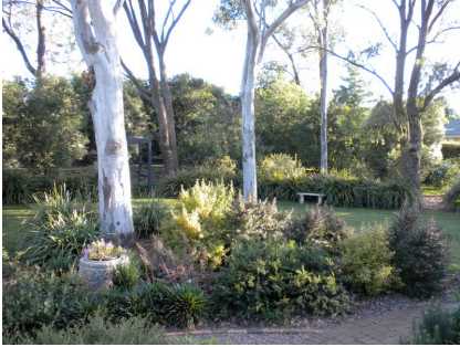
Wilderwood Garden

Nigel Lusk and Rod Barber opened their beautiful garden at 'Wilderwood', 45b Sunninghill Avenue, Burradoo, as part of the Open Gardens Australia Scheme on the weekend of 15-16 October and over 250 people visited the garden.