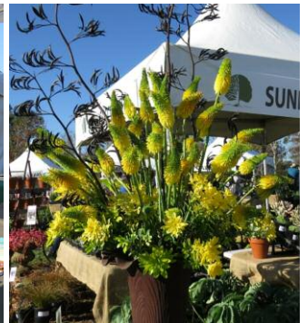
Les Musgrave's stunning arrangement