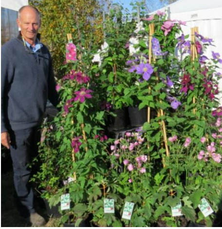
Alameda Homestead Clematis