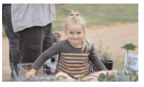
Never too young to start plant hunting