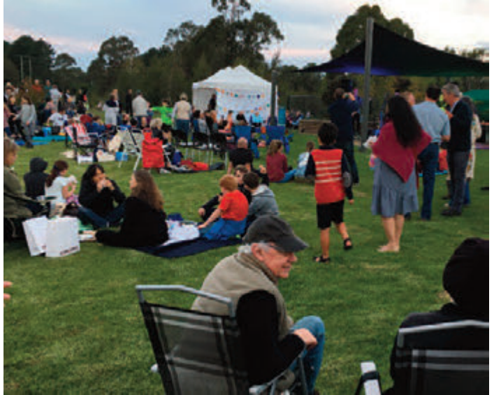
A picnic while waiting for darkness to fall

Over 500 people joined us on the evening of 24th March to celebrate Earth Hour and to see the wonderful artistic installation of the Vessels of Change.