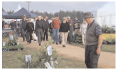
Finally inside! The crowds were lining up waiting for the magic hour of nine for the gates to open