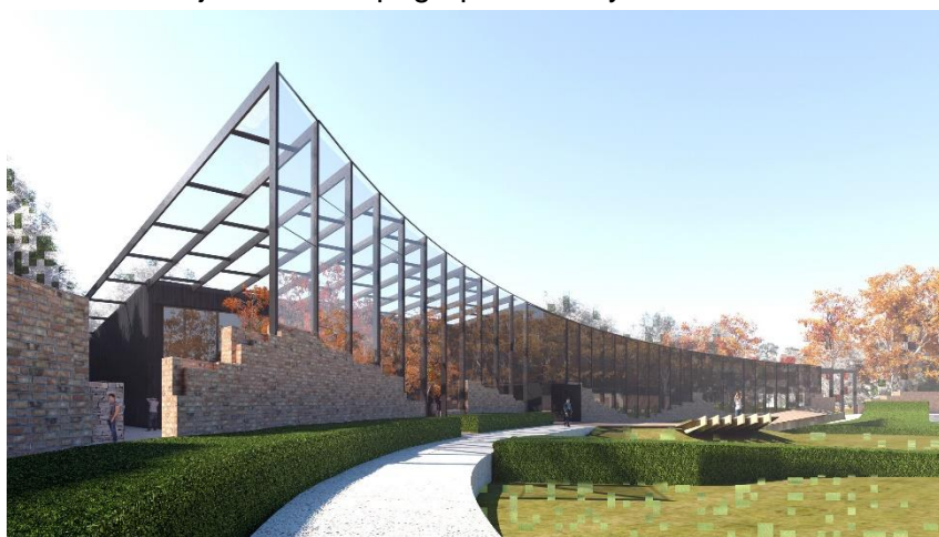
Proposed Visitor's Centre designed by John Wardle Architects

We have had a big spending year focussed on investing in our future development. Our plans for the Visitor Centre have been further developed, our Business Plan has been a major effort to set down what donors will help achieve by giving to this community project. And we have just had a topographic survey conducted on the site. This last one doesn't