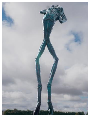
Leaping Frog by John Olsen

A very successful day at Harpers Mansion in Berrima, showcasing the vast array of plants grown by our enthusiastic Plant growers Group