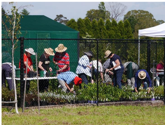
Volunteers helping out in the nursery

The number of subscribed Friends continues to grow and this is reflected in the steady numbers who attend working bees and events. Working bees this year have been well attended with an average of 30 per session on Tuesdays and 20 on our new Wednesday working bee.