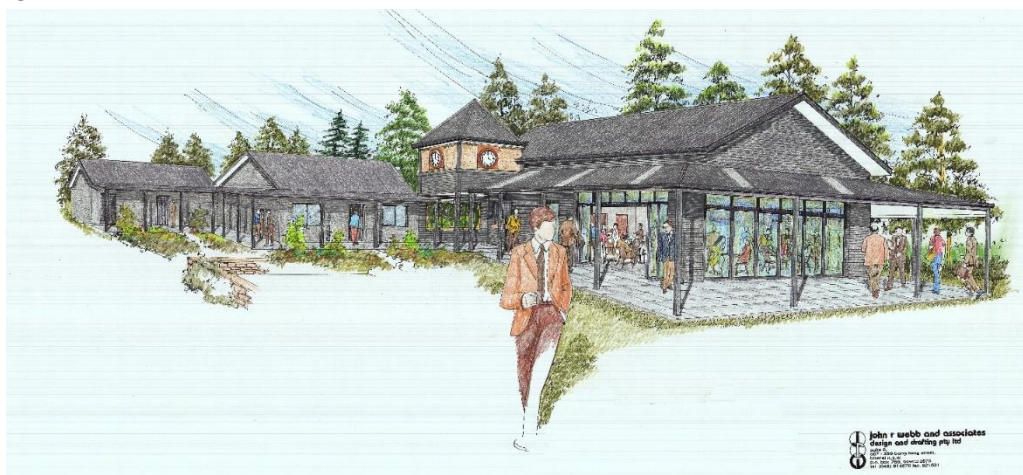
Proposed Education Centre adjacent to 'The Shed'

Funding of $500,000 for construction of the Education Centre is our immediate major goal. The Centre is highly desirable and should be achievable. It will represent a significant step in the development of the gardens and the services we can offer. Facilities to allow all-weather programmes for schools will increase awareness and involvement of younger families in the gardens.