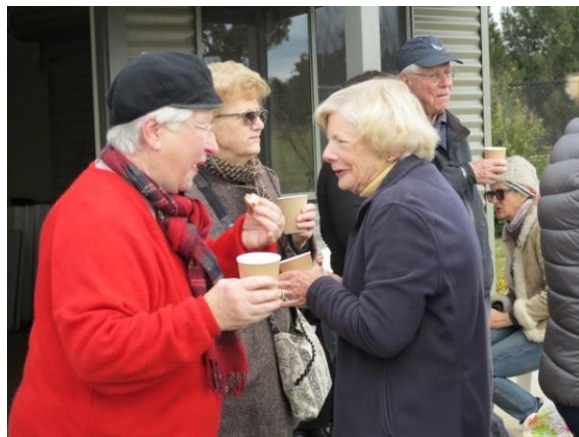
Volunteering isn't all about hard work

Community Involvement is the main theme for marketing of SHBG. We aim to increase awareness of our garden and activities in our local community. We want SHBG to be seen as a substantial community asset, to be used and enjoyed as public space as well as a source of horticultural education and art.